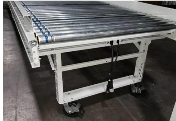
10 ft. CarterMobile™ Section Endview

Because CarterMobile™ is not a permanent MHE installation, there is little or no electrical or mechanical permitting required to install and operate in most U.S. jurisdictions.